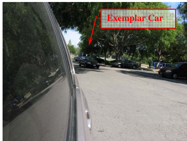
Officer's view of exemplar car at stop sign with rear-view mirror pendant (at #2)