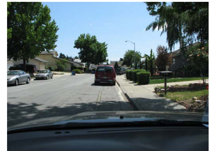
Exemplar view of Defendant from 60 ft with rear view mirror pendants (between #3 & #4)