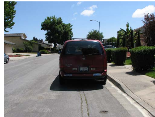
Exemplar view of Defendant from 20 ft with rear view mirror pendants (between #3 & #4)