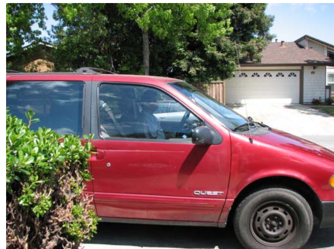
Exemplar view of Defendant as he passes on left with rear view mirror pendant (at #3)