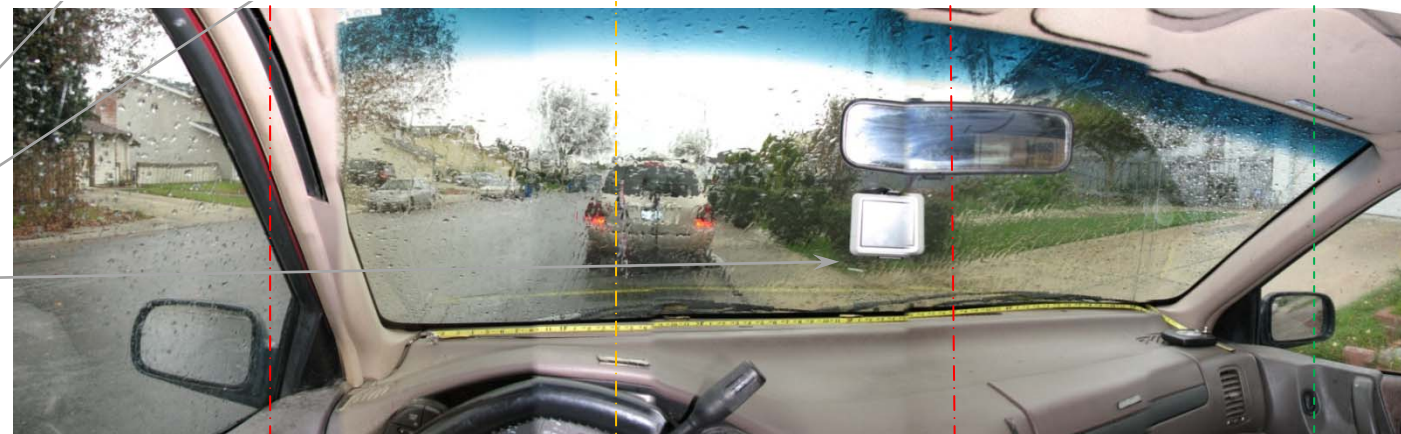
Panorama of Driver's View with Exemplar GPS Monitor