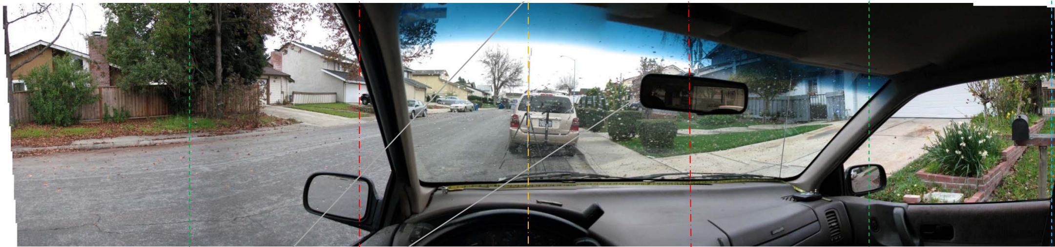
Panorama of Driver's View without Mirror Pendants